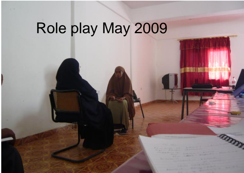
Role play May 2009