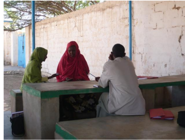
Students Interviewing Patients May 2009