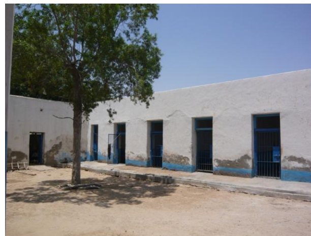
Berbera Mental Hospital