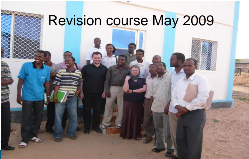
Revision course May 2009