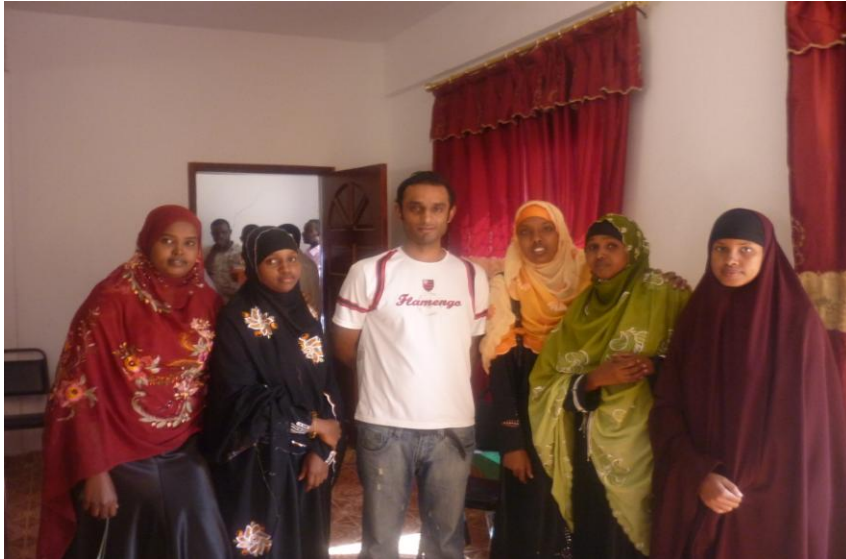
Female medical students Dec 2009