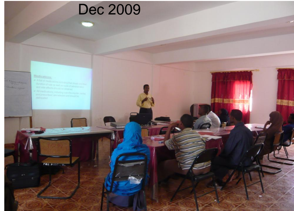
Mental health rep teaching Dec 2009