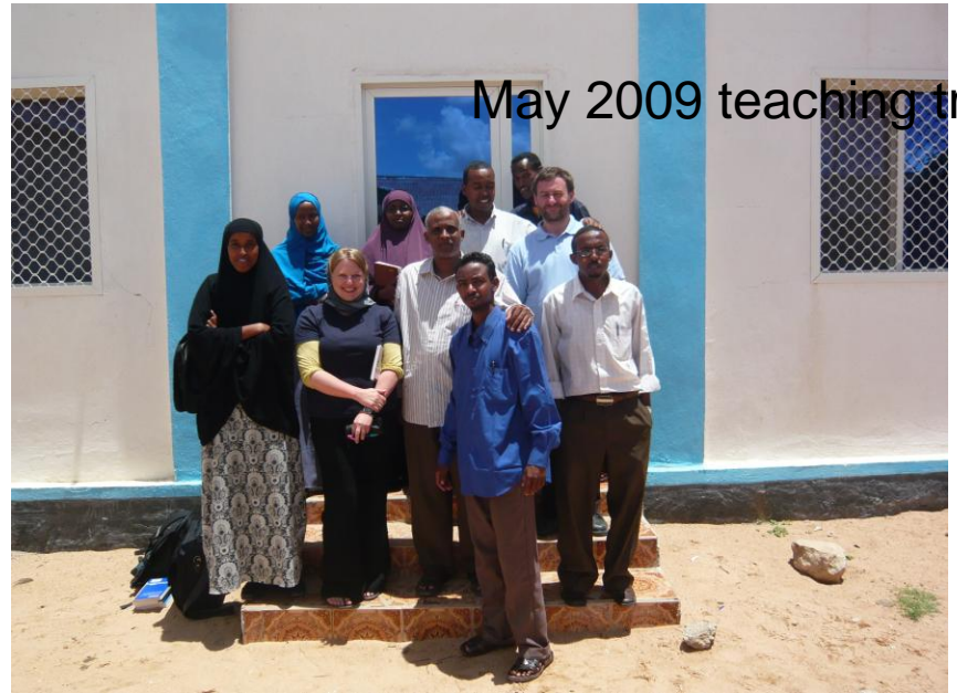
May 2009 teaching trip